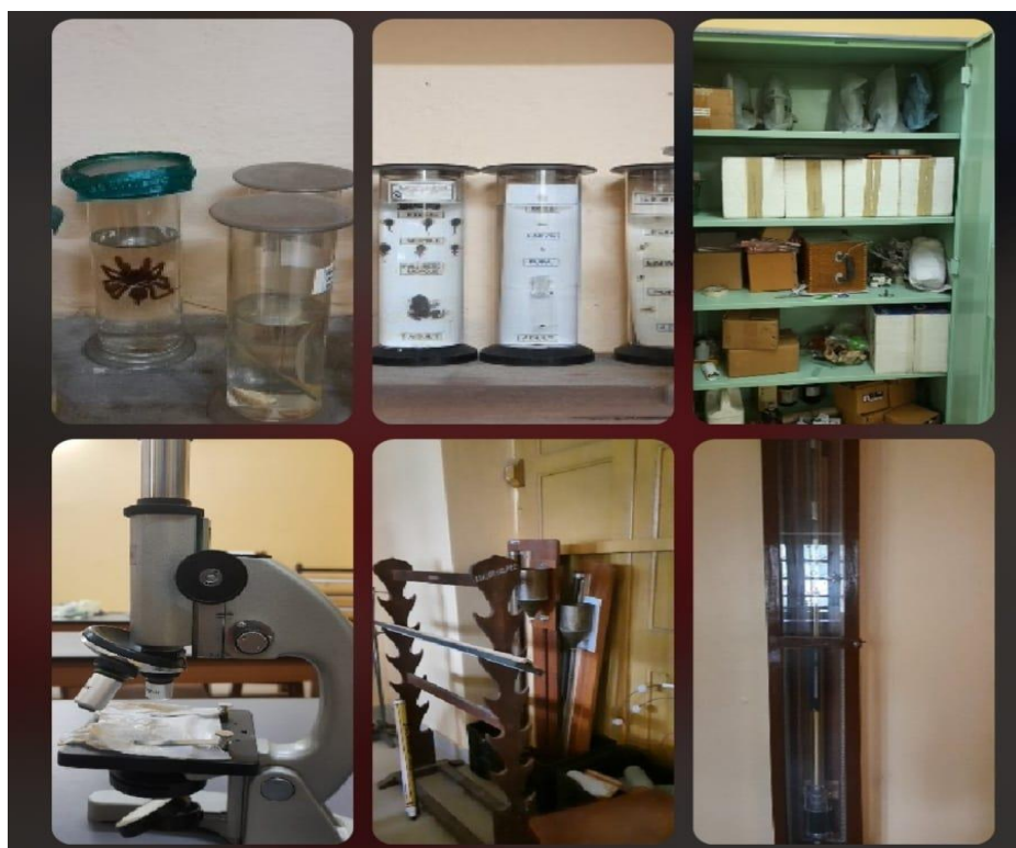
LIFE SCIENCE LAB

SCIENCE LAB: It would be rare to find any education course without a substantial component of laboratory activity. So, we arranged for a modernized and well equipped and well-maintained lab with all required facilities for our students for their experiments and work. It is observed that students should have full guidance and assistance in the lab.